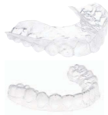
Upper and Lower Clear Retainers

✱ If the retainer is lost or broken there will be a replacement or repair charge.