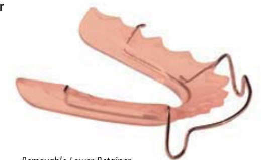
Removable Lower Retainer